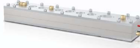
PN2410 Electrical FFF Module