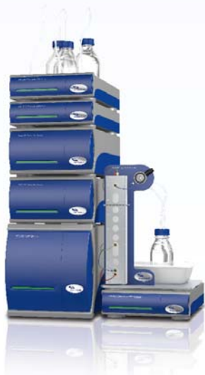
EAF2000 Electrical Flow FFF Channel