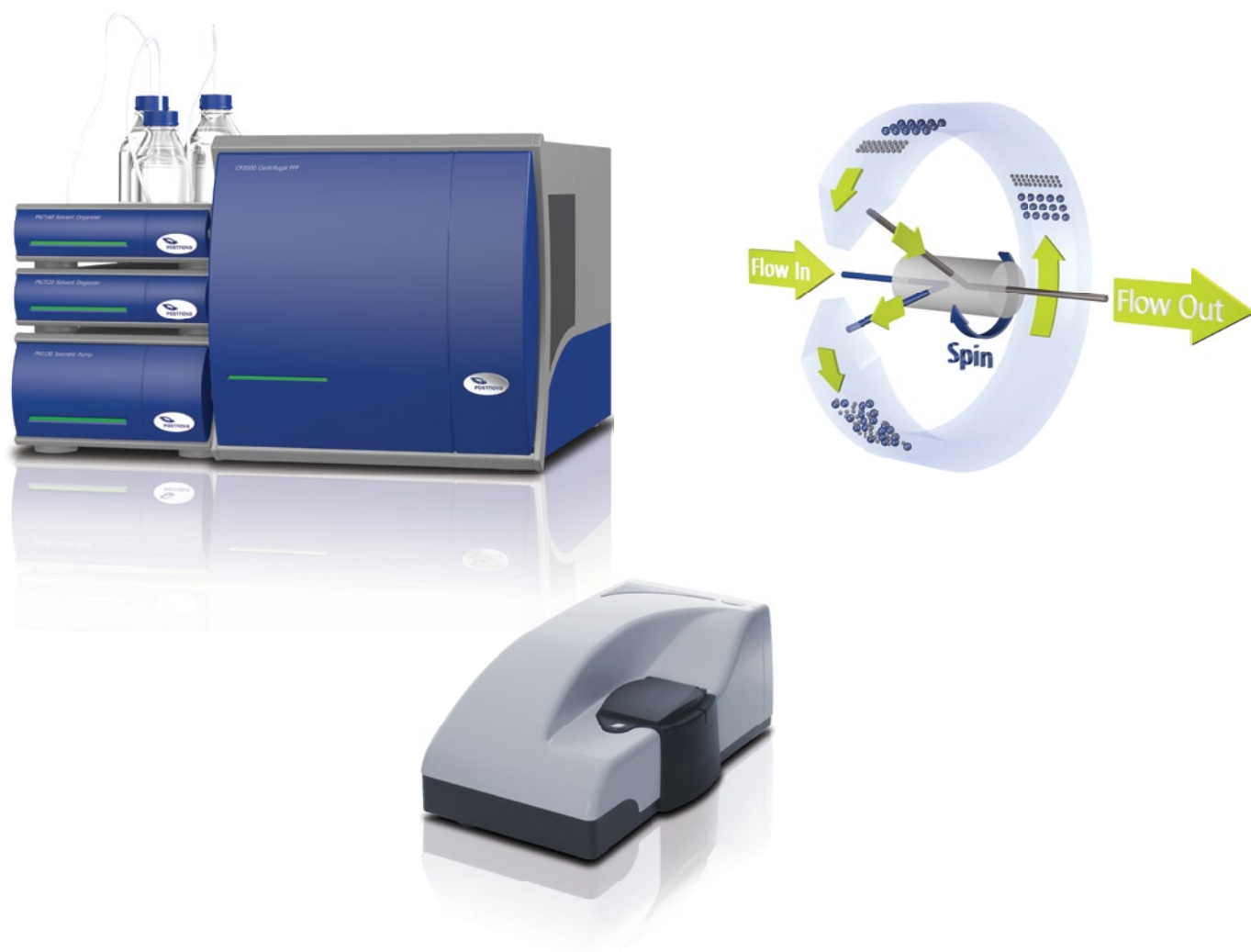
Figure 1: Instrumental Setup of the CF2000 from Postnova Analytics (top left), the Malvern Zetasizer Nano ZSP (bottom) and the Principle of Centrifugal FFF (top right).

Biodegradable nanoparticles (NPs) as drug delivery systems (DDS) for biomedical applications have become extremely attractive due to their stability in the blood stream and controlled release characteristics. In this study, polymer-based, non-cytotoxic NPs, in particular 200 nm PLGA NPs, were characterized according to their size and integrity of the particle formulation. PLGA was chosen due to its biodegradability, biocompatibility, controlled release characteristics and approval for therapeutic devices by the US Food and Drug Administration (FDA). Special focus was laid on the size and stability of these potent DDS over time in cell culture medium. Therefore, Centrifugal Field-Flow Fractionation (CF3) hyphenated with dynamic light scattering detection (DLS) was performed using such complex medium as eluent. With this setup, physiological conditions were closely mimicked and influences of the surrounding media as well as the sample preparation could be significantly minimized thereby offering a realistic insight into the behavior of such DDS under potential real-life application conditions [1].